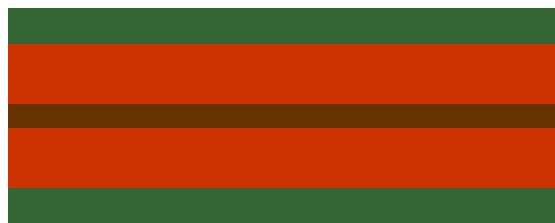
Trim raw edges even.

With right sides together, stitch each side of the pieced strip to the green strip, making a long tube. Press seams toward the green and turn right side out. Press so the green fabric creates an even border on each side of the pieced strip as shown: